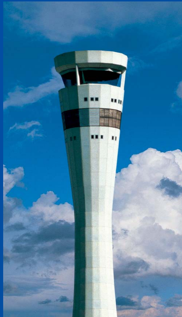
The Control Tower